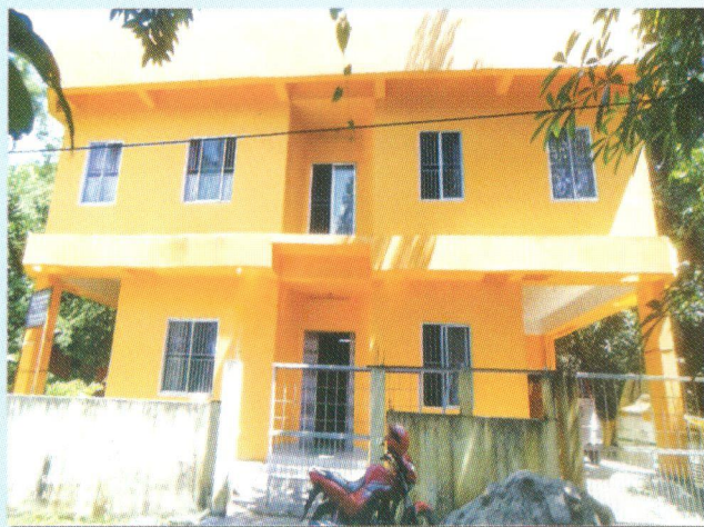
DDES, North Lakhimpur